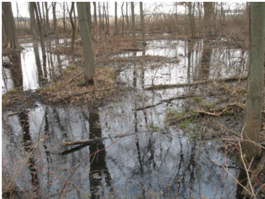
Natural Vernal Pools form a Mosaic of Micro Topography in a woodlot from Hancock County.

Tuesday-Thursday, January 29th-31st, 2008 —Ohio Federation of Soil & Water Districts Annual Meeting